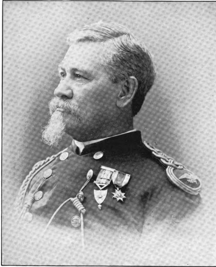
COLONEL ORLANDO METCALF POE. Brigadier General of U. S. Volunteers and Brevet Brigadier General U. S. A. Second Commander of Second Michigan Infantry.

The retirement of General Sherman from active service in 1883 broke up the Washington life. He wrote the following letter to General Poe: